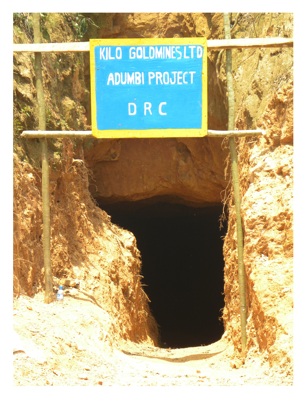
Figure 2) KGL Somituri Project - Adit entrance at the Adumbi site.