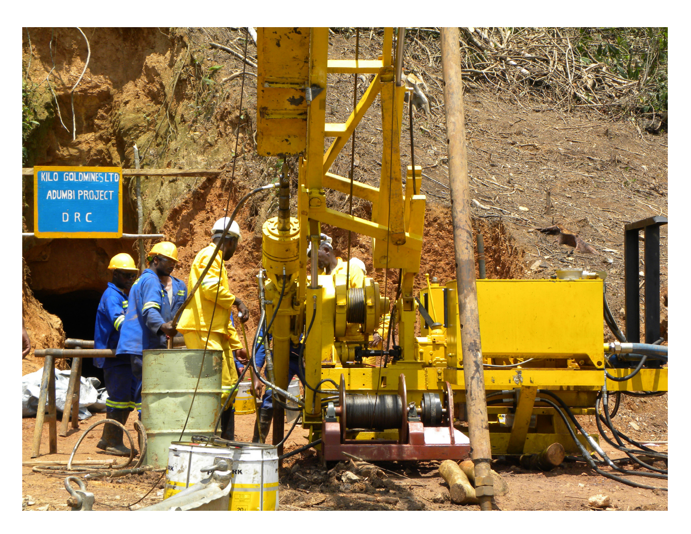
Figure 1) KGL Somituri Project – Diamond drilling at the Adumbi site.